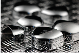
Steel toe cap