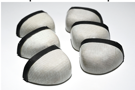
Composite toe cap