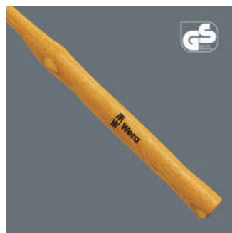
Powerful work is ensured with handles out of high quality ash wood.