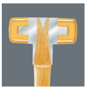
The double-sided conical design creates an unbreakable and secure link between the handle and head of the hammer.