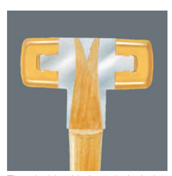
The double-sided conical design creates an unbreakable and secure link between the handle and head of the hammer.