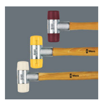
They come in soft, medium and hard designs for a wide range of applications from universal use to splinter-free applications on sharpedged work pieces.