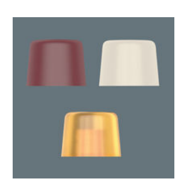
Versatile use thanks to the soft faced heads that can be retrospectively fitted.