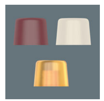
Versatile use thanks to the soft faced heads that can be retrospectively fitted.