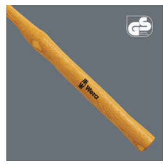
Powerful work is ensured with handles out of high quality ash wood.