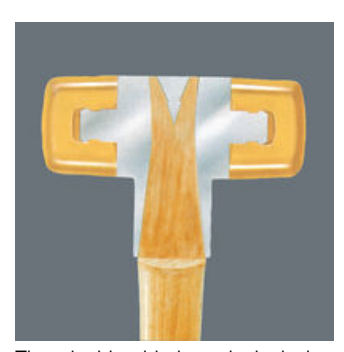
The double-sided conical design creates an unbreakable and secure link between the handle and head of the hammer.