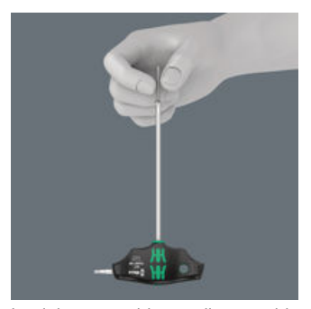
TORX® HF profile

In tight assembly or disassembly situations, for example in engine compartments, it is not possible to securely hold the screw with the hand on the screwdriver, and the screw subsequently often gets lost. Lengthy searches or the loss of the screw (with the associated danger that could bring about) are the consequence. The HF tools developed by Wera are ideal because they feature an optimised geometry of the original TORX® profile. The wedging forces from the surface resulting pressure between the drive tip and the screw profile mean that the screw is securely held on the tool!