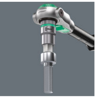
The clamping of the screw is achieved by a flexible locking ball. The holding function is especially helpful in confined, hard-to-reach spaces, where there is no room for a second hand to secure the screw.

Bit sockets with retaining function for hexagon socket screws