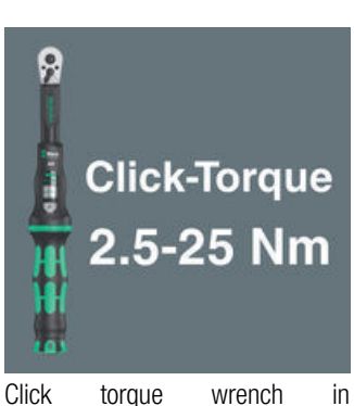
wrench unmistakable Wera design.