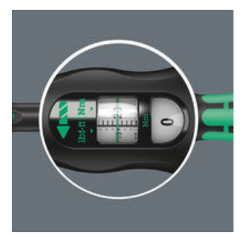
Easy setting and saving of the desired torque value; readable on the main and fine scales.