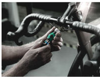
Stubby Ratchet Screwdriver with Bit Magazine