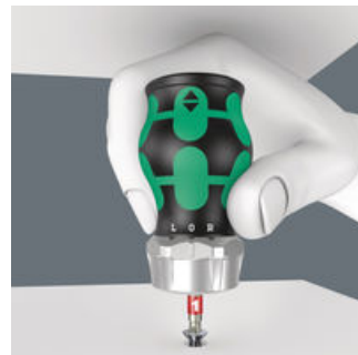
With its compact handle shape and the short blade, the Kraftform Stubbies are particularly suitable for working in confined screwdriving situations.