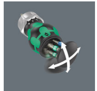
The swiveling bit magazine allows for the bits to be removed easily in almost any situation and cannot be lost. The bits are safely stored.