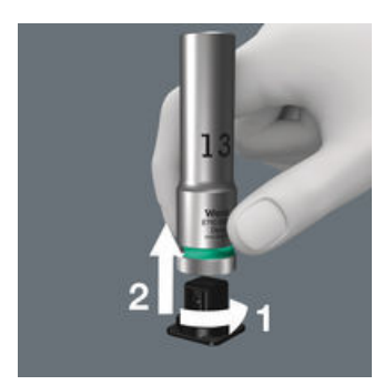
The all new smooth turning mechanism guarantees both secure and rattle-free storage, yet allows easy removal of the tool.