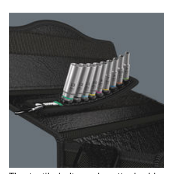
The textile belt can be attached by means of the nonwoven reverse side and the hook and loop strips e.g. to a wall, shelf, tool trolley and to the Wera 2go tool transport system.