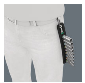
The robust textile belt can be secured to a belt loop or pocket by means of the snap hook.