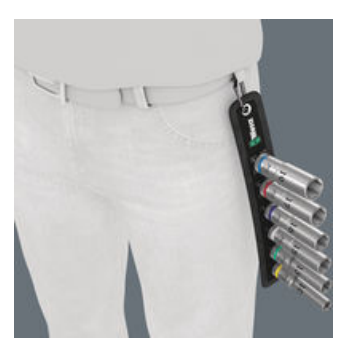
The robust textile belt can be secured to a belt loop or pocket by means of the snap hook.