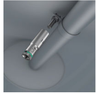
Due to the long design of the socket, screwdriving can also be achieved in small spaces. Fittings with protruding threaded rods are often also possible.