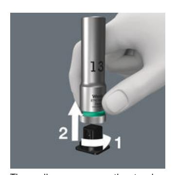
The all new smooth turning mechanism guarantees both secure and rattle-free storage, yet allows easy removal of the tool.