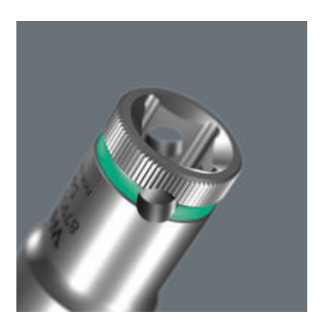
Knurling on lower end for more grip when used manually.