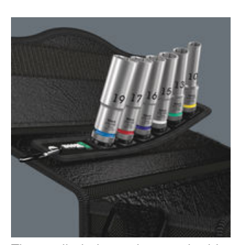
The textile belt can be attached by means of the nonwoven reverse side and the hook and loop strips e.g. to a wall, shelf, tool trolley and to the Wera 2go tool transport system.