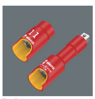
The Zyklop sockets and extensions for electricians offer increased safety thanks to their 2-component isolation with yellow insulation core under red insulation outer layer.