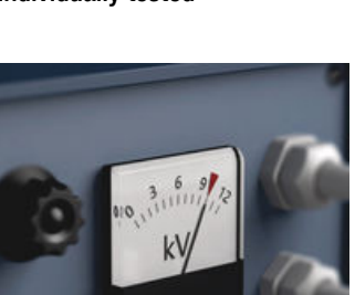
The individual testing at 10,000 volts, in accordance with IEC 60900, ensures safe working with loads up to 1,000 volts.