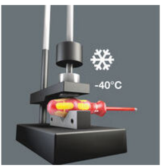
Impact strength tested at -40°C, guaranteeing safety even under extreme conditions.