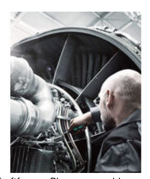
Kraftform Plus screwdrivers ergonomics you can grasp. They relieve the entire hand-arm system even when used intensively. Along with other technical and product advantages such as the Lasertip for a secure fit in the screw head, Kraftform screwdrivers are the ideal choice whenever manual screwdriving jobs are concerned.