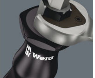
Hexagonal blade and bolster for higher torque transfer.

Further versions in this product family: