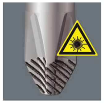
A precisely-focused laser creates a sharp-edged surface structure. Wera Lasertip "bites" itself into the screw head and prevents any slips out of the recess. It is available for screwdrivers for slotted, Phillips and Pozidriv screws.

It happens time and time again that the tip slips out of the screw head when screwdriving, sometimes damaging valuable surfaces or even causing injury. The tips of the Wera Lasertip screwdrivers are microscopically roughened by means of a laser. This rough surface literally "bites" itself firmly into the screw head. Slipping out becomes a thing of the past.