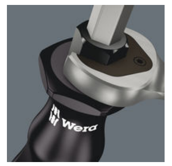
Hexagonal blade and bolster for higher torque transfer.

Further versions in this product family: