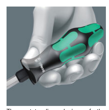
The outstanding design of the Kraftform handle that fits perfectly into the hand prevents hand injuries such as blisters and calluses.

The basic idea for the prototype of the Kraftform handle - that the hand should dictate the design has, right through to today, proved to be correct. In cooperation with the internationally recognised Fraunhofer IAO Institute, Wera developed a screwdriver handle designed to match the shape of the human hand as long ago as the 1960s. After a long development phase, the Wera Kraftform handle was launched to the market in 1968. It has been optimised through the years with new technologies, but has kept its proven shape. After all, the human hand has not changed either.