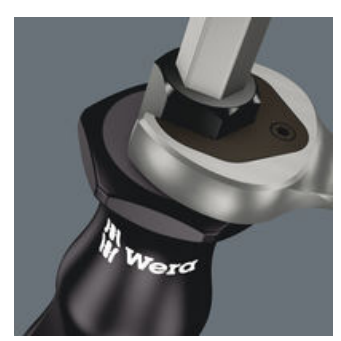
Hexagonal blade and bolster for higher torque transfer.