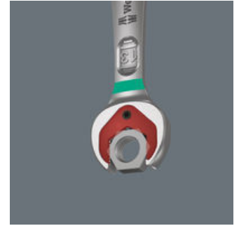
Ring ratchet spanner Joker 6000

The Joker's holding function means that nuts and bolts can be held in the jaw and easily positioned where they are needed. Fastening on to the thread can then be done quickly and safely, thanks to the innovative special stop-plate which holds the fastener. No more time-wasting searches for dropped nuts and bolts! After applying and positioning the nut or bolt, fastening can begin immediately - no additional tools required.