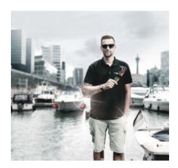
We questioned the classic L-key design, since all too often the screw head recess is rounded out, meaning screws can no longer be tightened or loosened - and so the user finds the L-key slipping out of the recess. Wera Hex-Plus tools have a larger contact surface in the screw head. The notching effects are reduced and thereby the deformation of the screws. At the same time, as much as 20 % more torque can be applied.