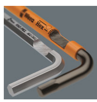
L-keys made from circular material fit into the hand better and allow less strenuous work over a longer period. Additionally, the rubber sleeve provides a pleasant grip, particularly in applications at low temperatures. Colour coding and large stamp enable the desired Lkey to be easily located. Moreover, the round material keys are more robust, particularly where smaller sizes are concerned.