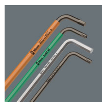
The size of each L-keys has been engraved by a laser. In addition Take it easy L-keys have a colour coding according to sizes - for simple and rapid accessing of the required tool. Making it easy to find the right tool.