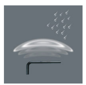
L-keys with BlackLaser surface treatment for outstanding surface protection and long service life. High corrosion protection.