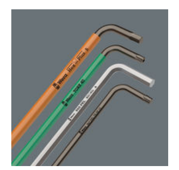
The size of each L-keys has been engraved by a laser. In addition Take it easy L-keys have a colour coding according to sizes - for simple and rapid accessing of the required tool. Making it easy to find the right tool.

Hexagon screws can endure a problem because the contact surfaces delivering the power from conventional the tool, is transferred to the screw via very small surface areas. The consequence: the screw can become damaged (rounding out). Hex-Plus tools have a greater contact surface that prevents this from happening! At the same time, as much as 20 % more torque can be applied. Good to know: Hex-Plus tools fit into every standard hexagon socket screw!