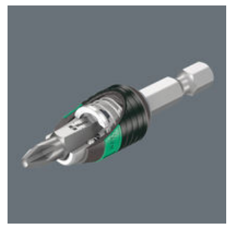
Rapid bit change without needing any additional tools. One-hand operation with a freely spinning sleeve for simplified guidance of the tool. Also available in a BiTorsion design.