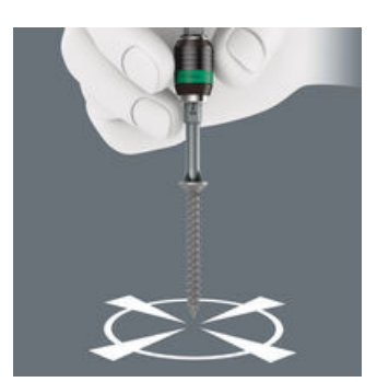
The free-turning sleeve allows screw steadying at the start of the screwdriving process. This makes it easier to apply the tool to the screw and prevents slipping. It can also be used as a short extension for 1/4" applications e.g. in combination with the Wera Zyklop Ratchets.