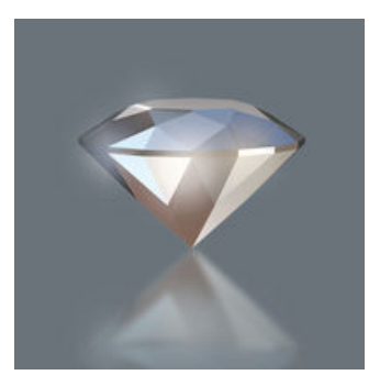
Another product advantage is the coating of the Impaktor bits with minute diamond particles.