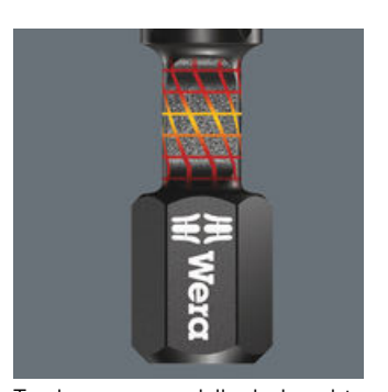
Torsion zone specially designed to absorb such forces and thereby protect the bit tip.