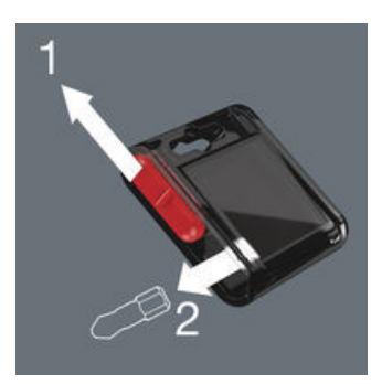
The slide switch allows a simple and gradual removal and reinsertion of the bits. The transparent reverse side means that it is easy to know how many bits are still in the box.