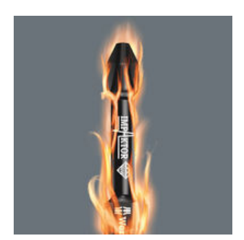
Maximum utilisation of the material properties, a very special geometry - designed particularly to meet the extreme demands - as well a specific manufacturing process mean that Wera Impaktor tools have an above-average service life.