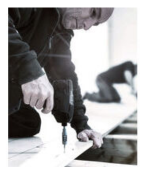
Impaktor technology for an aboveaverage service life even under extreme demands