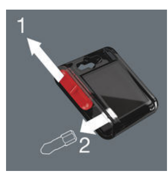
The slide switch allows a simple and gradual removal and reinsertion of the bits. The transparent reverse side means that it is easy to know how many bits are still in the box.