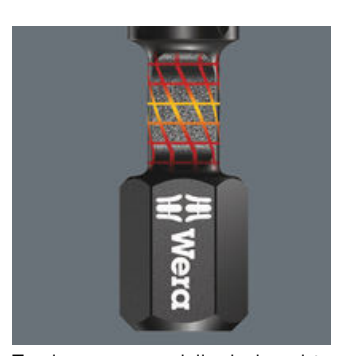
Torsion zone specially designed to absorb such forces and thereby protect the bit tip.