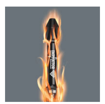
Maximum utilisation of the material properties, a very special geometry - designed particularly to meet the extreme demands - as well a specific manufacturing process mean that Wera Impaktor tools have an above-average service life.