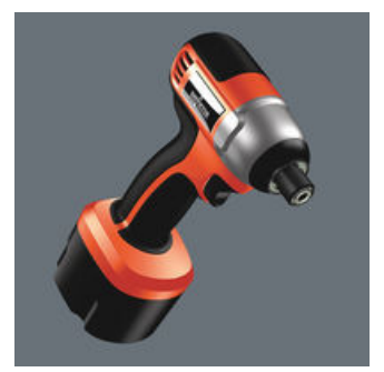
For use with impact screwdrivers. Improve productivity when screwdriving with power tools.