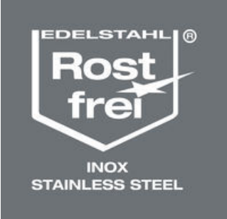
Solution to the rust problem: screwdriving stainless steel together with stainless steel! Wera stainless steel tools are manufactured out of stainless steel so unsightly rust can be avoided.

Screw stainless steel together with stainless steel!