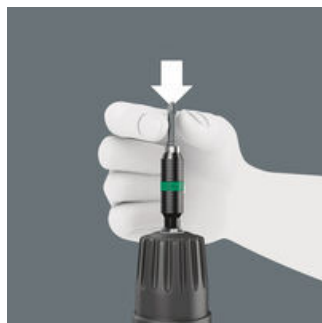
Rapid-in and self-lock

The bit can be pushed into the adaptor without moving the sleeve. The lock is activated automatically as soon as the bit is applied to the screw. Bits are held securely and wobble-free.