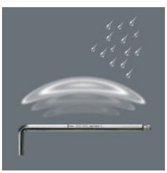
Chrome-plated hexagon L-keys for outstanding surface protection and long service life. High corrosion protection.