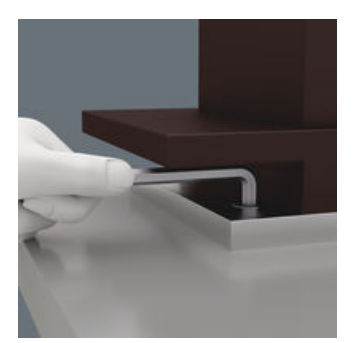
All users will recognise the need to saw or grind down L-keys to make them shorter for particularly confined screwdriving jobs. This has the disadvantage that they no longer have any corrosion protection at the separation point and secondly, they can become "soft" and therefore useless due to an alteration in the hardening during the shortening process.