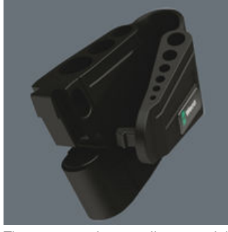
The wear-resistant clip material ensures that the L-keys are securely held yet are easy to remove.