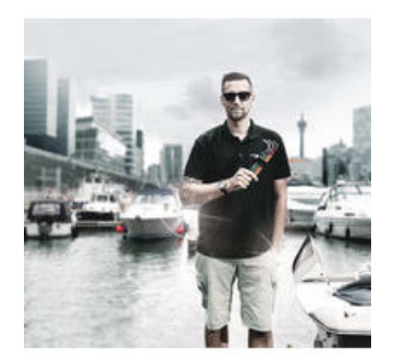
We questioned the classic L-key design, since all too often the screw head recess is rounded out, meaning screws can no longer be tightened or loosened - and so the user finds the L-key slipping out of the recess. Wera Hex-Plus tools have a larger contact surface in the screw head. The notching effects are reduced and thereby the deformation of the screws. At the same time, as much as 20 % more torque can be applied.