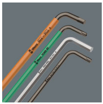
The size of each L-keys has been engraved by a laser. In addition Take it easy L-keys have a colour coding according to sizes - for simple and rapid accessing of the required tool. Making it easy to find the right tool.