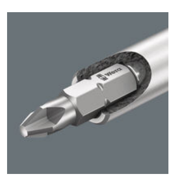
With stainless steel sleeve and strong permanent magnet.