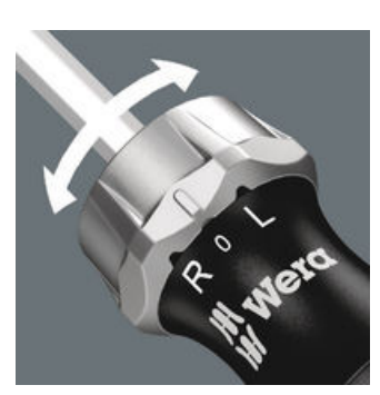
Ergonomic design of the reverse direction switch.