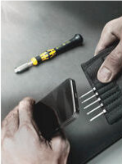
In a practical pouch