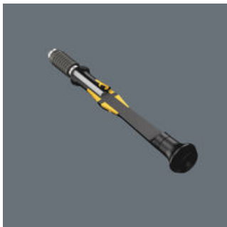
Multi-component screwdriver handle for ergonomic working.