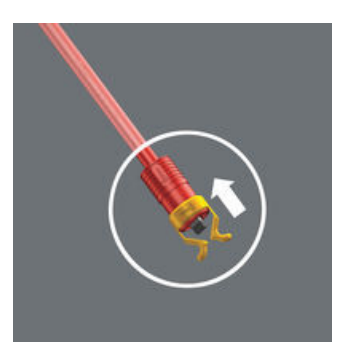
Push the screw gripper onto the tip of the screwdriver until the end of the blade protrudes from the rubber blade holder.