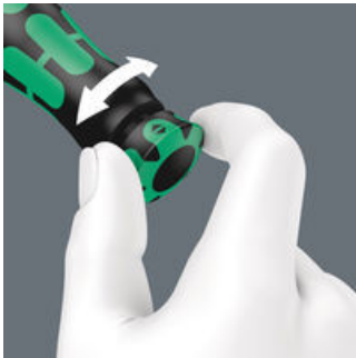
With audible and tactile clicks when adjusting the scale values.