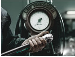
Reversing with square head insert