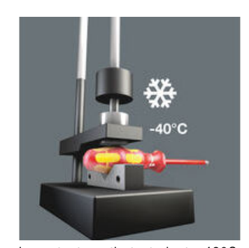
Impact strength tested at -40°C, guaranteeing safety even under extreme conditions.