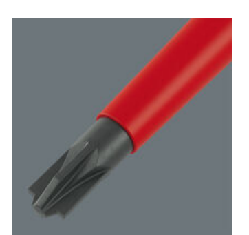
For the use in terminal blocks, control cabinets, switches, relays, sockets etc.