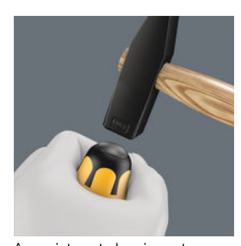
An integrated impact cap lengthens the service life and reduces the danger of splintering. Nevertheless, always wear protective goggles.