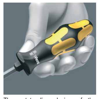
The outstanding design of the Kraftform handle that fits perfectly into the hand prevents hand injuries such as blisters and calluses.

The basic idea for the prototype of the Kraftform handle - that the hand should dictate the design has, right through to today, proved to be correct. In cooperation with the internationally recognised Fraunhofer IAO Institute, Wera developed a screwdriver handle designed to match the shape of the human hand as long ago as the 1960s. After a long development phase, the Wera Kraftform handle was launched to the market in 1968. It has been optimised through the years with new technologies, but has kept its proven shape. After all, the human hand has not changed either.