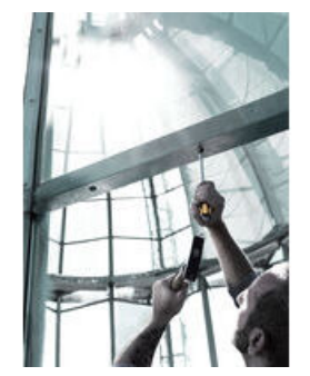
Screwdrivers are often misused as chisels. This can be dangerous. The chiseldriver is the solution when not only screwdriving is required. For fastening, chiselling and loosening seized screws. Wera chiseldriver: the screwdriver whenever the going gets tough!