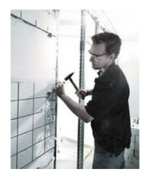
Screwdrivers are often misused as chisels. This can be dangerous. The chiseldriver is the solution when not only screwdriving is required. For fastening, chiselling and loosening seized screws. Wera chiseldriver: the screwdriver whenever the going gets tough!