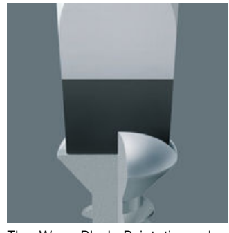
The Wera Black Point tip and a refined hardening process ensure long service life of the tip, improved corrosion protection and an exact fit.