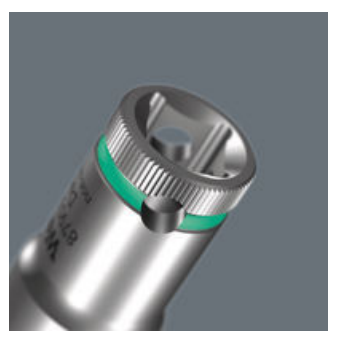
Knurling on lower end for more grip when used manually.

The hexagon profile allows the transmission of high forces and puts less strain on the edges of bolts or screw heads than a double hexagon profile. Fine-toothed ratchets also make the use of a double hexagon profile superfluous, even in confined spaces, thanks to their small return angle.