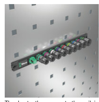
Thanks to the magnet, the rail is suitable for temporary attachment to the wall, shelf or workshop trolley.

https://products.wera.de/en/ratchets\_and\_accessories\_the\_zyklop\_ratchets\_the\_zyklop\_ratchets\_1\_2\_zyklop\_accessories\_1\_2\_socket\_rail\_c\_impaktor\_1.html