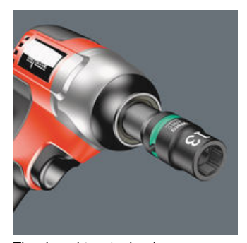
The Impaktor technology ensures above-average service life of the Impaktor socket wrench plug-ins even under extreme conditions.

For electric or pneumatic impact wrenches