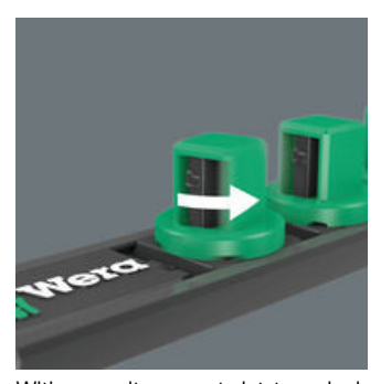
With its twist-to-unlock mechanism the socket rail ensures easy access of the sockets. At the same time the sockets are held securely.