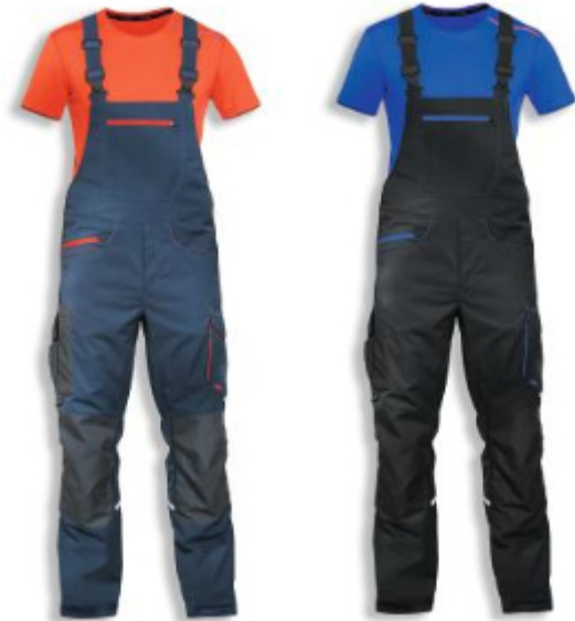
Model-Nr.: 8998 Art.-Nr.: 89702 (navy) 89703 (graphite)

With kneepockets (suitable kneepads available as Art.-Nr. 9868900)