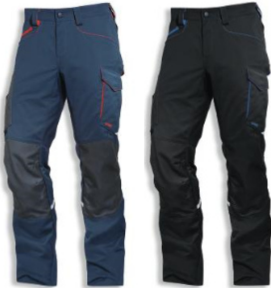
Model-nr.: 8997 Art.-Nr.: 89668 (navy) 89669 (graphite)