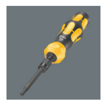
The Wera impact screwdriver bits are particularly suitable for use with the Wera 921 impact screwdriver.