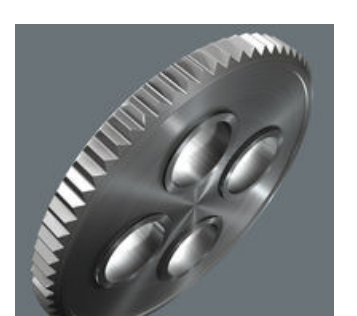
The fine tooth mechanism, with its 60 teeth, allows a small return angle of only 6° - ideal for precision work.