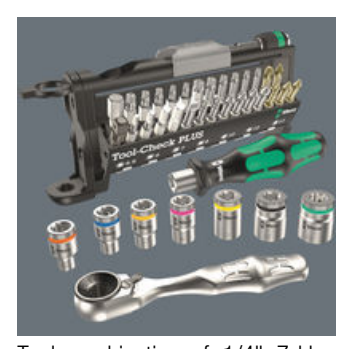
Tool combination of 1/4" Zyklop Mini ratchet, sockets, one bitholding screwdriver and bits in a space-saving Tool-Check PLUS case made of robust plastic.