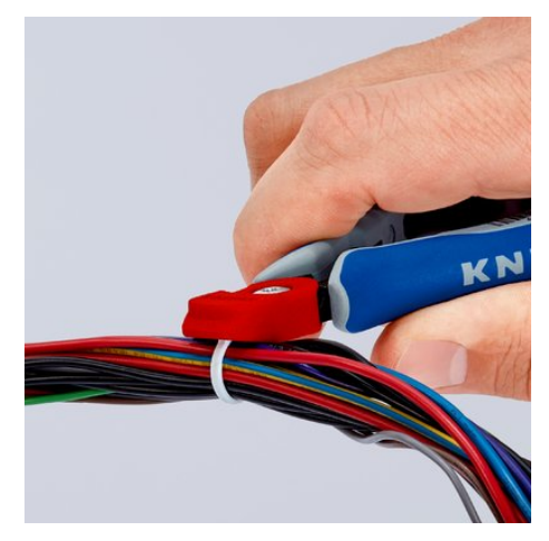
Remove the head of the cable tie using the Electronics Diagonal Cutter...