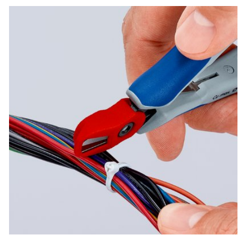
Easy attachment: the material catcher is easily attached and fastens securely to the pliers head