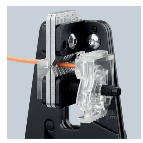
Precise cutting of the insulation to a complete extent