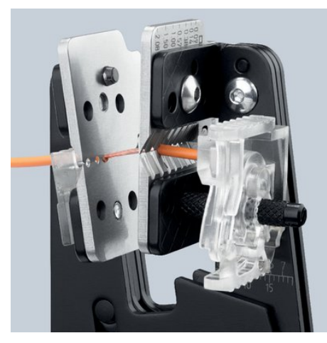
Positive stripping thanks to precise shape of the blades

Kapton® is a registered trademark of E. I. du Pont de Nemours and CompanyRadox® is a registered trademark of Huber & Suhner AG