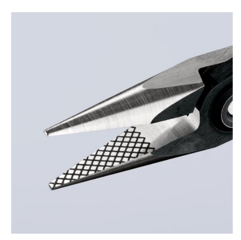
Cross-shaping: precision laser cut for a secure grip in ultra fine mounting work