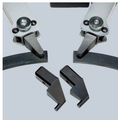
replaceable inserts for internal and external circlips