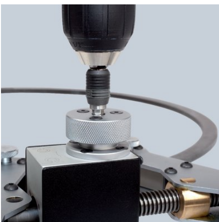
Power tool or manual operation