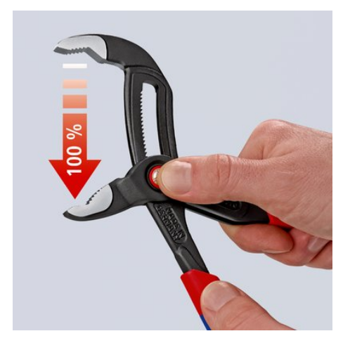
Press the button – open pliers completely

Position jaw – simply slide and close pliers