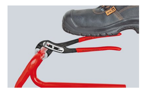
Self-locking on pipes and nuts: no slipping on the workpiece; the complete actuating force can be used to turn the workpieces; not having to squeeze the pliers handles reduces the required effort