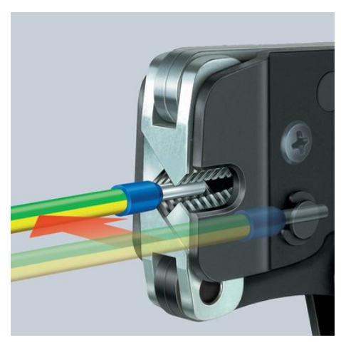
97 53 08: lateral loading of wire ferrules up to 2.5 mm² parallely from the side e.g. in confined areas