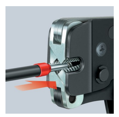
Front loading of wire ferrules e.g. in switchboards