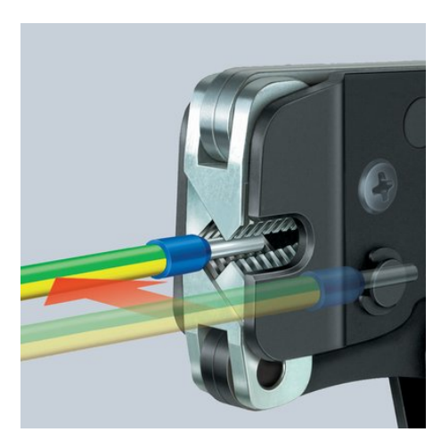
97 53 08: lateral loading of wire ferrules up to 2.5 mm² parallely from the side e.g. in confined areas