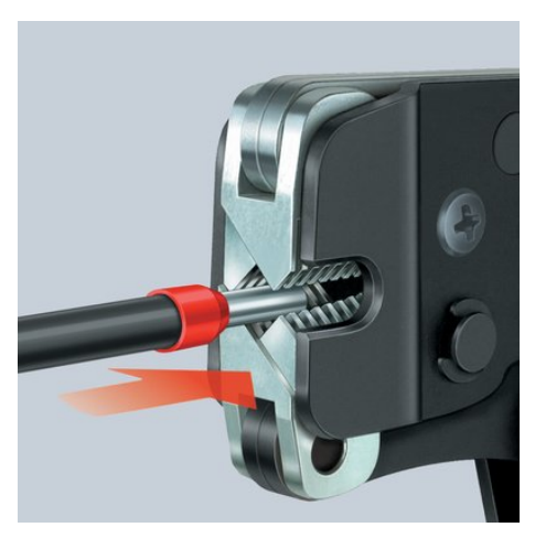
Front loading of wire ferrules e.g. in switchboards