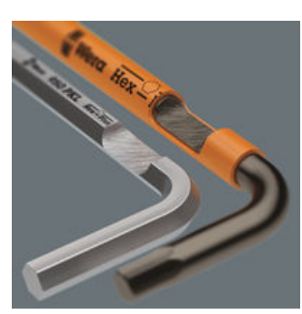
L-keys made from circular material fit into the hand better and allow less strenuous work over a longer period. Additionally, the rubber sleeve provides a pleasant grip, particularly in applications at low temperatures. Colour coding and large stamp enable the desired Lkey to be easily located. Moreover, the round material keys are more robust, particularly where smaller sizes are concerned.