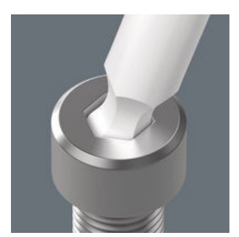
The spherical drive profile means that it is possible to swivel the axis of the tool to that of the screw, and therefore enable angled, "around-the-corner" screwdriving jobs.

Hexagon screws can endure a problem because the contact surfaces delivering the power from the conventional tool, is transferred to the screw via very small surface areas. The consequence: the screw can become damaged (rounding out). Hex-Plus tools have a greater contact surface that prevents this from happening! At the same time, as much as 20 % more torque can be applied. Good to know: Hex-Plus tools fit into every standard hexagon socket screw!